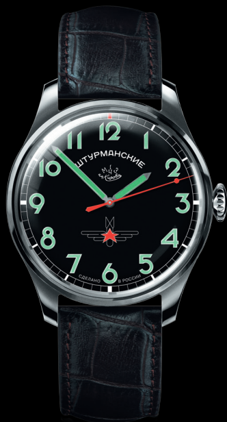
REF. 2609/3707128 CASE TITANIUM STRAP DARK BROWN LEATHER DIAL BLACK, WITH LUMINOUS INDEXES AND HANDS