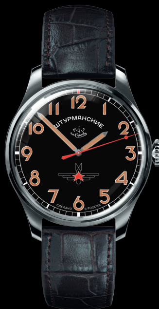
REF. 2609/3707130 CASE TITANIUM STRAP DARK BROWN LEATHER DIAL BLACK, WITH LUMINOUS INDEXES AND HANDS