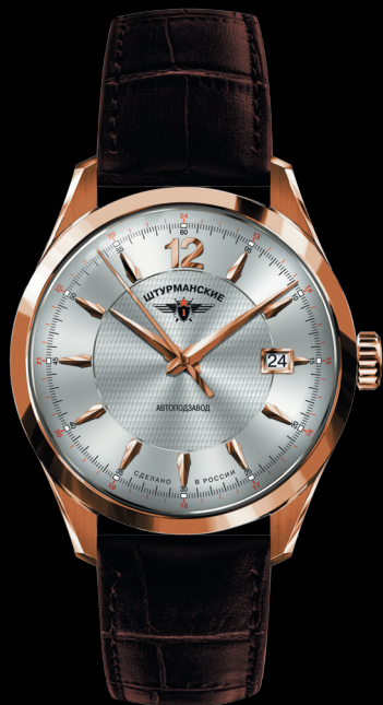
REF. 2416/1866997 CASE STAINLESS STEEL WITH GOLD PLATING STRAP DARK BROWN LEATHER DIAL SILVERY DIAL WITH APPLIED INDEXES