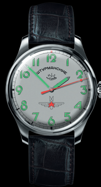
REF. 2609/3707131 CASE TITANIUM STRAP DARK BROWN LEATHER DIAL GREY, WITH LUMINOUS INDEXES AND HANDS