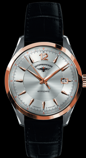
REF. 2416/1869991 CASE STAINLESS STEEL WITH GOLD PLATING STRAP BLACK LEATHER DIAL BLACK DIAL WITH APPLIED INDEXES