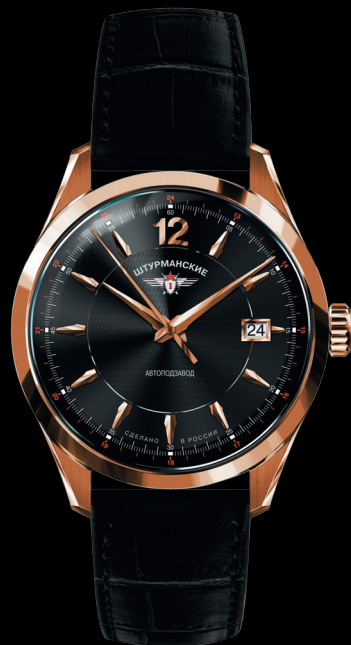
REF. 2416/1869998 CASE STAINLESS STEEL WITH GOLD PLATING STRAP BLACK LEATHER DIAL BLACK DIAL WITH APPLIED INDEXES